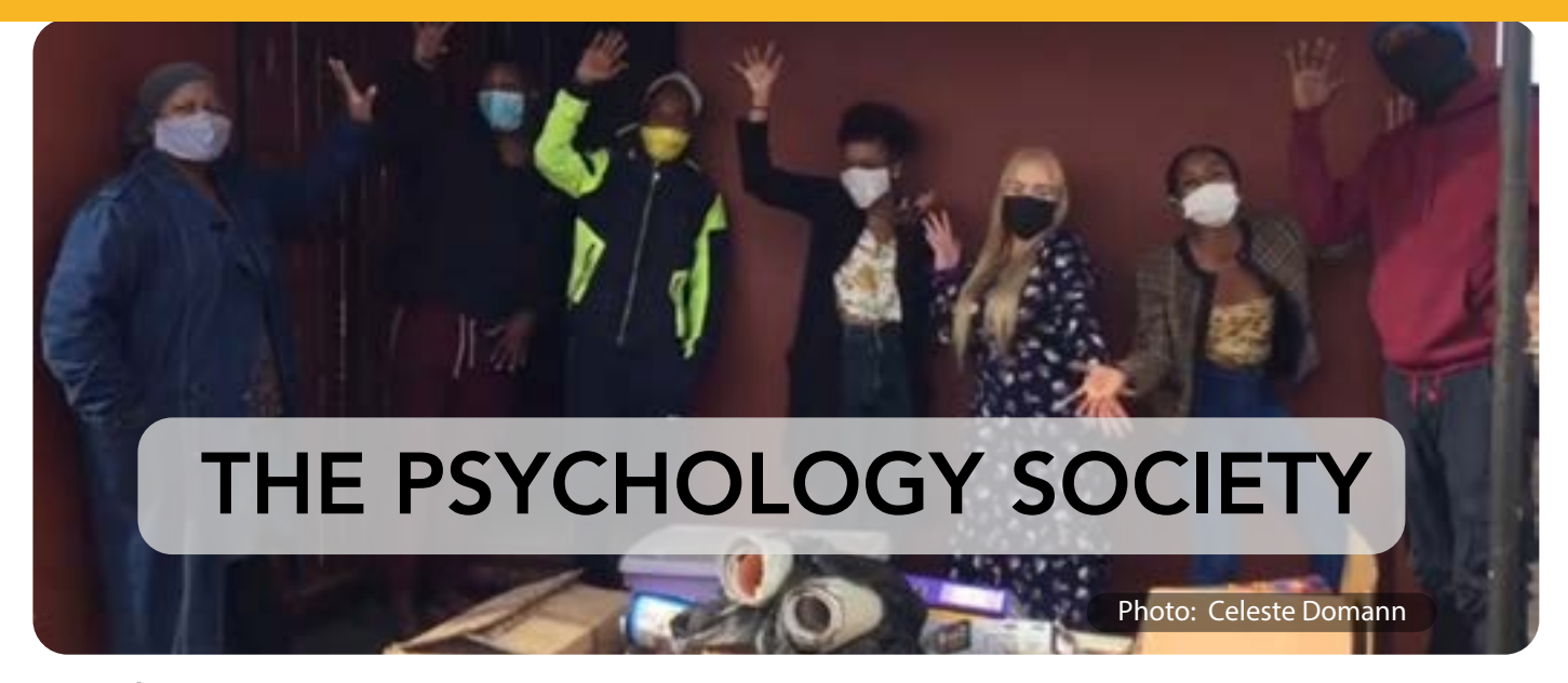
LIFESTYLE & ENTERTAINMENT

Let's all do our best to be water wise and lead a water conscious lifestyle!